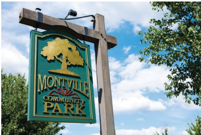
AT THE TOP: Montville, with its picturesque hilltop park, was one of eight high-ranked New Jersey towns in Money magazine's recent survey.